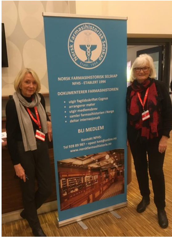
NFHS banner at "Farmasidagene 2018"