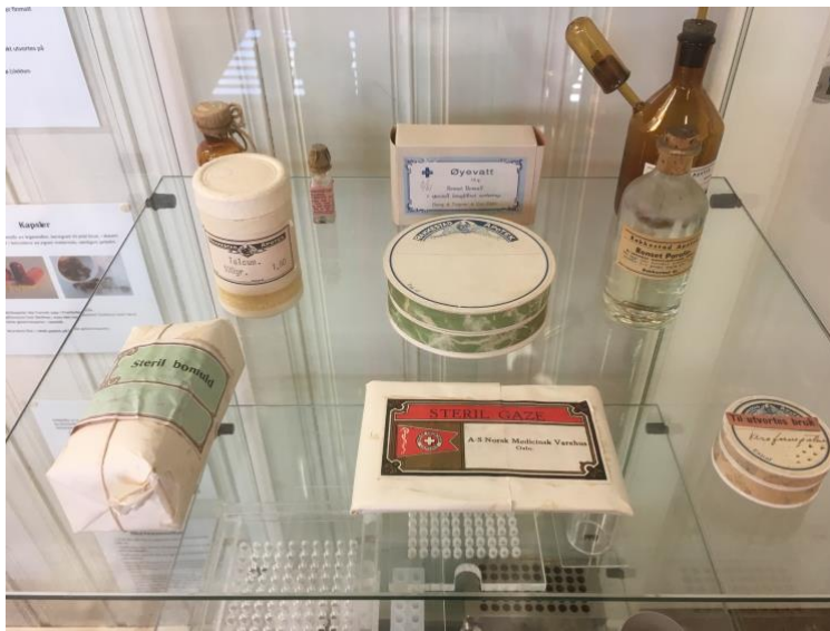
From the pharmacy exhibition at EkornRingen